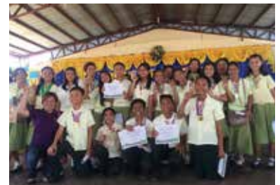
Volunteer Scholarship Program

IBIDEN Philippines, Inc. has conducted a scholarship program for high school students in poor families throughout the year by collecting donations from our employees, in cooperation with high schools. In fiscal year 2017, 108 employees' donations helped 178 students. We also donate income from "Chovola" activities of IBIDEN Co., Ltd. (see page 54) for this program.