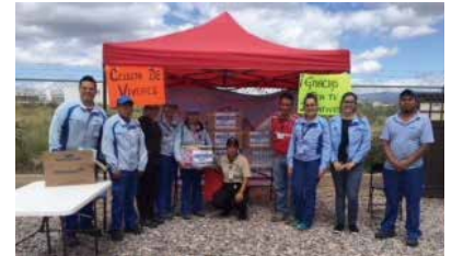
Activity to collect donation of relief supplies

At IBIDEN México, S.A. de C.V, we contributed donations and provided relief supplies, donated from employees to regional organizations, as a disaster victim-oriented support activity.