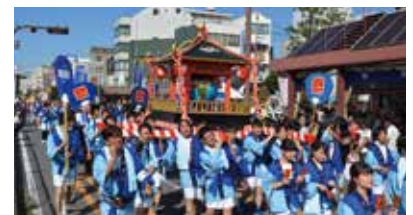
The Jumangoku Festival

More than 100 employees have participated in the festival each year. We strongly advocate local revitalization efforts, and support the “festival spirit” together with local residents. Moreover, IBIDEN's scope of involvement expanded in fiscal year 2009, when its employees initiated cleanup activities after the festival around the thoroughfare leading to the main train station.