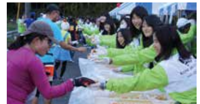
Volunteers for water supply

The IBIDEN Group serves as an official sponsor of the Ibigawa Marathon, a sporting event that takes place in the town of Ibigawa-cho each November. To support the event, we make parking spots available at our plant in Ibigawa-cho, and participate in volunteer activities as a staff for traffic control in the surrounding area and water stations.