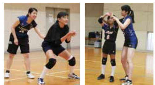
Volleyball class for junior high school students

The IBIDEN women's volleyball club has held volleyball classes such as technical guidance for neighboring elementary, junior and high school students and their mothers as a community contribution activity through volleyball. In fiscal year 2016, we presented the classes seven times for more than 900 participants. In addition, the Group's Social Contribution Committee works with the Seinou Regional Moms' Volleyball Association to host annual the IBIDEN Cup Moms' Volleyball Tournament. In fiscal year 2016, the tournament marked its 11th occurrence, with 350 members from 29 teams taking part.