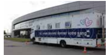
Blood donation activity of IBIDEN DPF France S.A.S.

The domestic Group companies have registered as Blood Donation Supporters in a program directed by the Japanese Red Cross Society, running social blood donation drives to provide a steady supply of donated blood. At the overseas Group companies, many employees have also participated in blood donation activities.